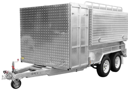
Tandem Mower Trailer