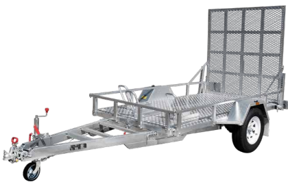
9x5 UTV Mower Trailer