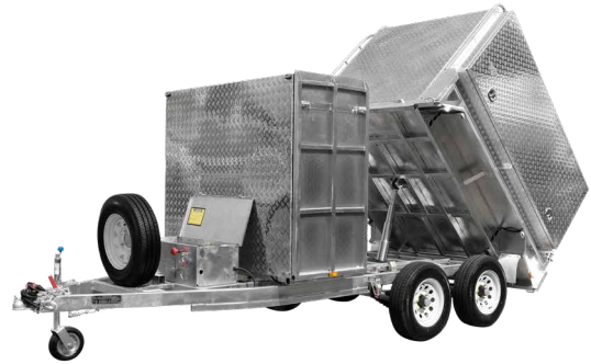
Hydraulic Mower Trailer